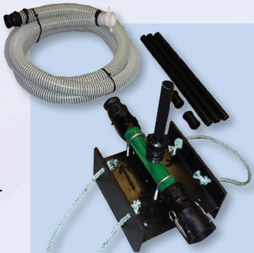
Figure 1: Venturi on stand with 2" female camlock coupling on inlet (left) and 2" male camlock coupling on outlet (right), pipework for air inlet and 2" delivery hose.