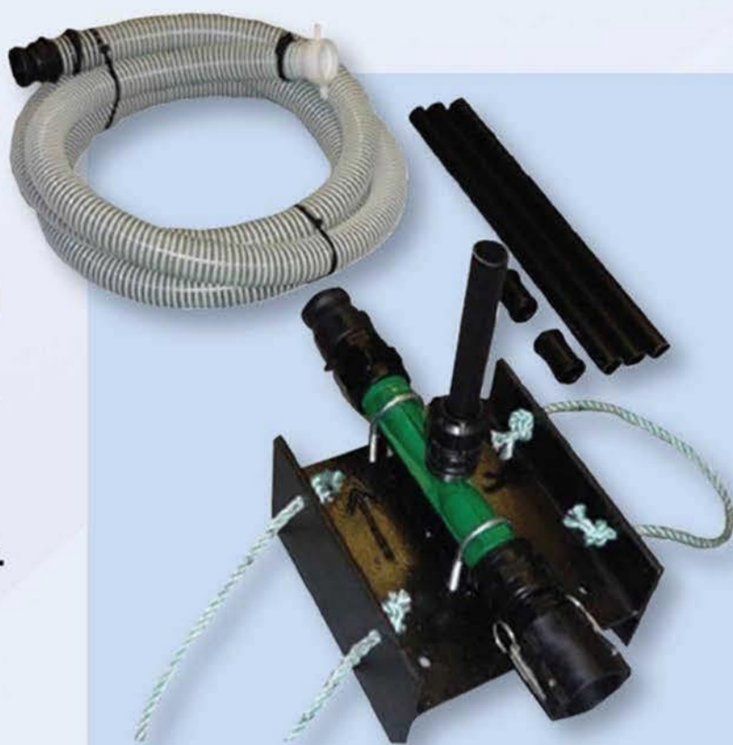
Figure 1: Venturi on stand with 2" female camlock coupling on inlet (left) and 2" male camlock coupling on outlet (right), pipework for air inlet and 2" delivery hose.